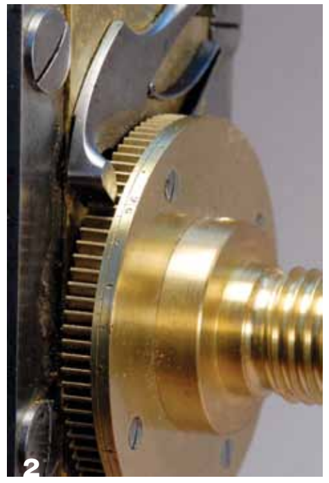
Pawl and detent style of indexing on the eccentric chuck. This one has 96 divisions, typical of most antique eccentric chucks.

have incorporated this useful feature on their own fronts, thereby decreasing the overhang that would result if the spiral chuck was simply screwed on to the front another chuck.