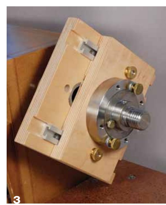
This shopmade eccentric chuck looks ungainly to most woodturners but works fine turning at 2 RPM.

Complexity of design continues to increase with very specialized oval chucks to allow oval, or more correctly, elliptical work. That complexity escalates until finally the most complex of all chucks, the geometric chuck. A well-equipped, multistage geometric chuck enables the creation of a mindnumbing number of looped patterns akin to those produced by a child's Spirograph. In the Victorian era, patterns created with multistage geometric chucks were considered so difficult to reproduce that they were used for printing security papers, such as bank notes (Photo 1).